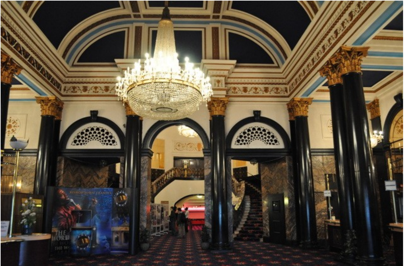
Foyer, July 2013

The London Scout Gang Show moved to The Gaumont State Theatre in 1973 and in 1974 after 44 glorious years, the curtain came down on “London’s Farewell Gang Show”.