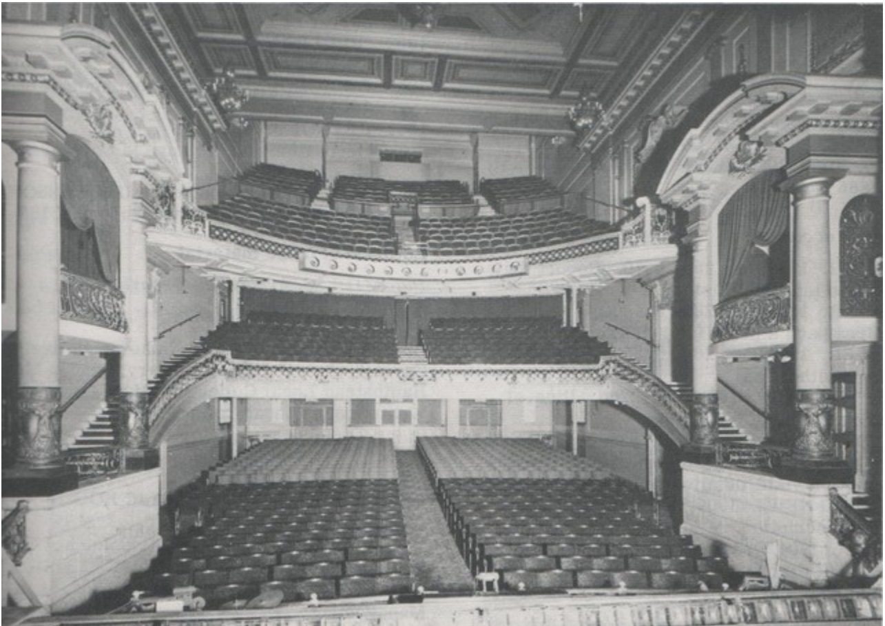
The Scala Theatre, Charlotte Street, London W1 in 1912

The Scala Theatre, in Scala Street, London W1, was the original theatre where “The London Scout Gang Show” was performed, from 1932 to 1938. In 1939 “The London Gang Scout Show” that was in production was cancelled due to the outbreak of WWII in September 1939.